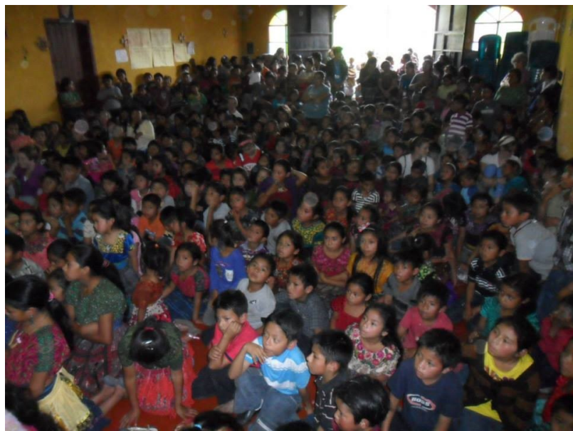
Pictured above are hundreds of children hearing about the word of God.