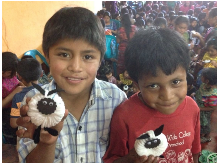
These little boys are showing off their sheep crafts made of pool noodles, yarn and felt.